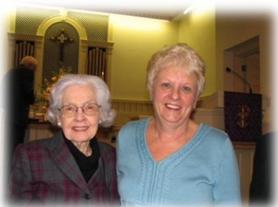
UMW Day 2010