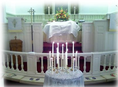
All Saints Day 2010