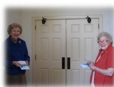
UMW Day 2010