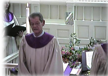
Christmas Cantata 2010