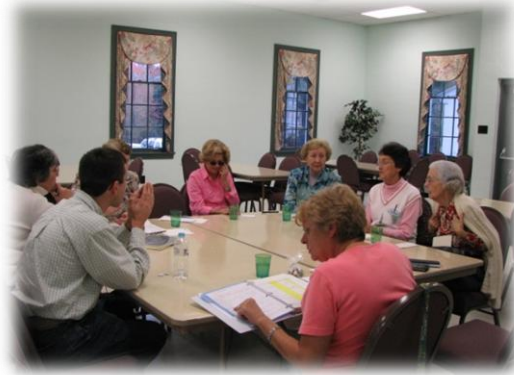
Council Planning Meeting