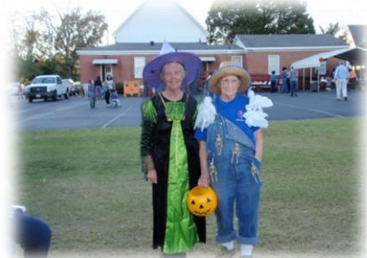
Fall Festival 2010