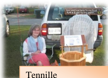
Tennille Community Fall Festival 2010