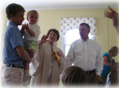
Family Day 2010