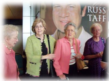
Gaithers Trip 2010