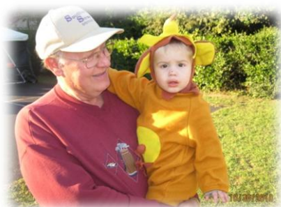
Fall Festival 2010