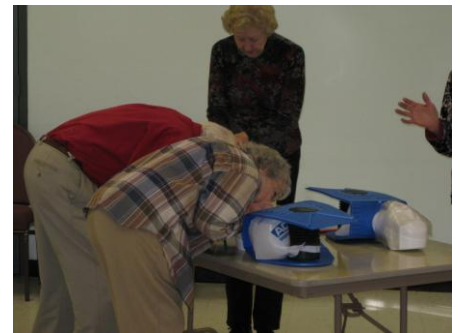
CPR classes at TUMC