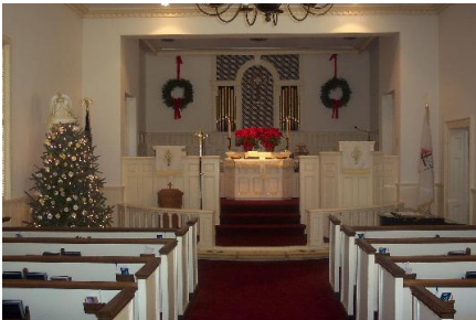
December 24: Christmas Eve Communion Service

Sunday, December 13 at 5:00 p.m. - TUMC Christmas Program in the sanctuary